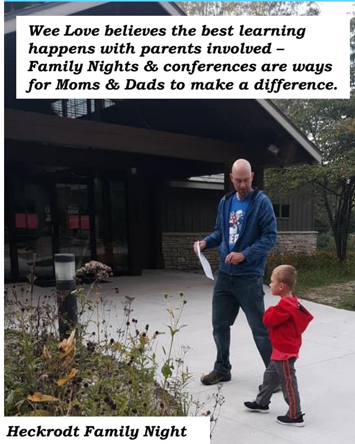
Heckrodt Family Night

Wee Love believes the best learning happens with parents involved – Family Nights & conferences are ways for Moms & Dads to make a difference.